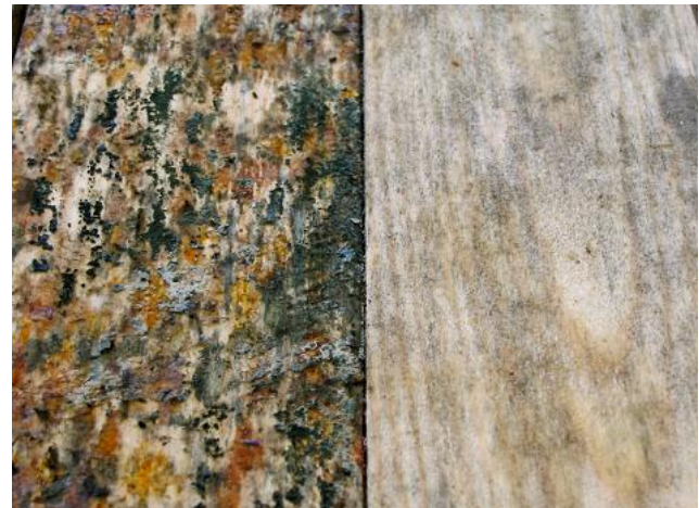
Figure 3: Development of mould on ISPM No 15 heat-treated pine sapwood (left) and untreated control (right) after 14 days under plastic cover