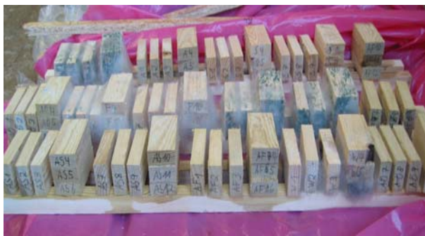
Figure 4: Small size test specimens used in screening fungistatic effect of environmentally compliant agents

specimens which were shortly submerged in the solutions and later stored in very humid climate at 20°C to prevent drying. Those that proved to be effective for the target period of 2-3 weeks were solutions of sodium carbonate or washing soda (E500), sodium sorbate (E201) and potassium carbonate (E501). Going back into very old literature it could be shown that carbonate treatment has a fungistatic (Heinzerling, 1885; Löfflad, 1979) and fire retarding (Mahlke-Troschel, 1950) effect on dried wood.