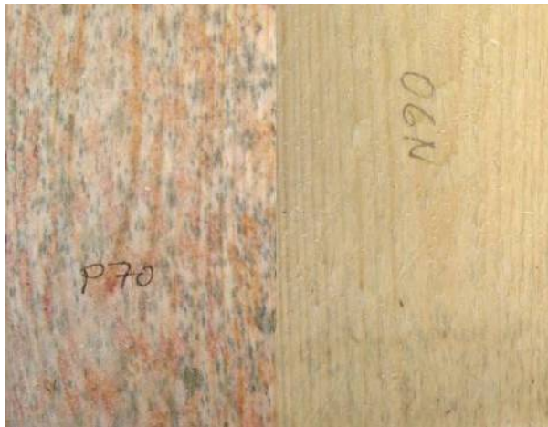
Figure 2: Development of mould on ISPM NO 15 heat-treated pine sapwood (left) and untreated control (right) after 7 days under plastic cover

Laboratory results impressively confirm reports obtained from operational practice. Practitioners assert that mould problems on green sawn timber for packaging purposes have increased dramatically after introduction of the ISPM No 15 heat-treatment. As a consequence, a few producers of packaging material have decided to use kiln dried material, some use anti-blue stain treatment, whilst others kiln dry the finished pallets. The remaining rest tries to optimize logistics in order to minimize time between production of sawn timber, heat-treatment, production of packaging material and delivery to customer. In such cases the customer might receive mould free pallets, but even in this case mould might develop after some days of storage without sufficient ventilation, e.g in containers.